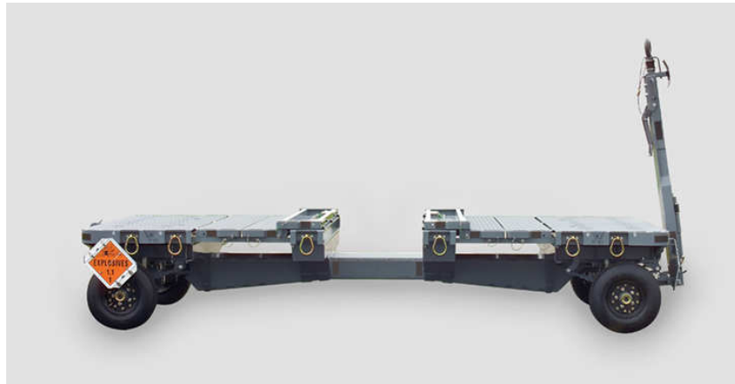
MHU-226 Photo of Center Door Opened

This unit includes a WASP designed and welded aluminum frame/deck structure. The deck features three identical openings equally spaced the length of the trailer allowing for loading/unloading of all weapons, with all loaders. The running gear incorporates double Ackerman (four wheel coordinated) steering, which provides superior tracking. The UMT is equipped with four pneumatic tires mounted on two axle assemblies capable of supporting the weight of the fully loaded trailer at speeds of 15 mph and an empty trailer at 30 mph. The brake system consists of disc brakes with a parking brake system on all four wheels and a breakaway braking system that includes a lanyard on the lightweight towbar for attachment to the vehicle.