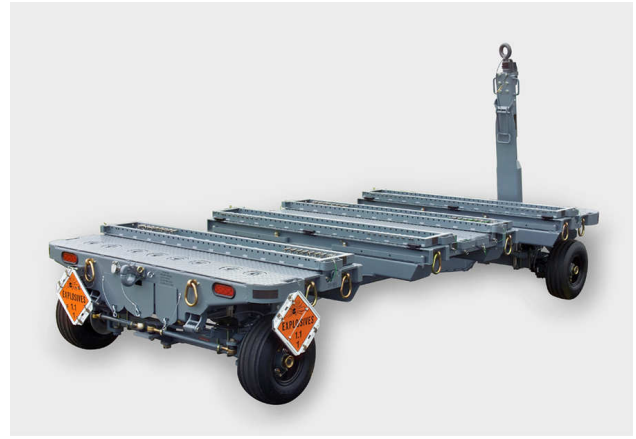
MHU-226 Photos of 2 Doors Opened